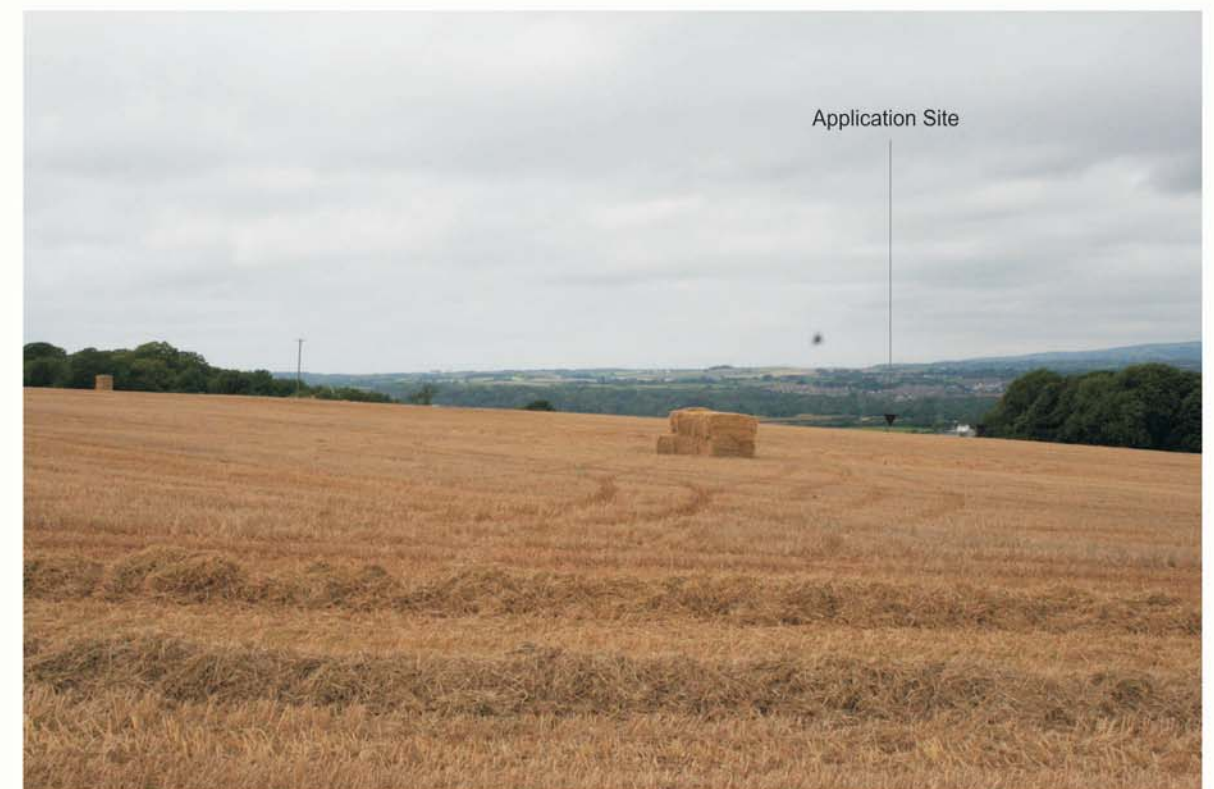
PRV 04 - View from Footpath 14b looking northwest