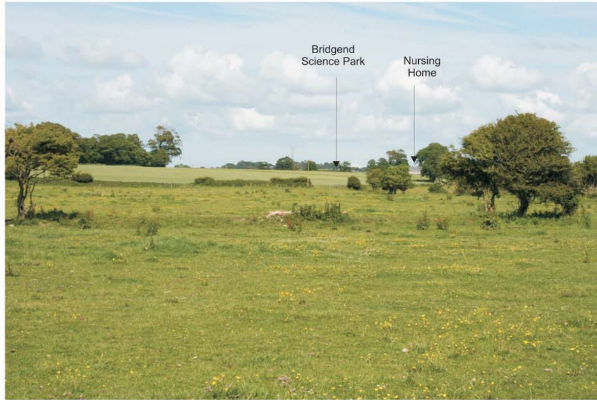
PRV 13 - View from Footpath FP13MM bordering the Ewenny River looking northeast