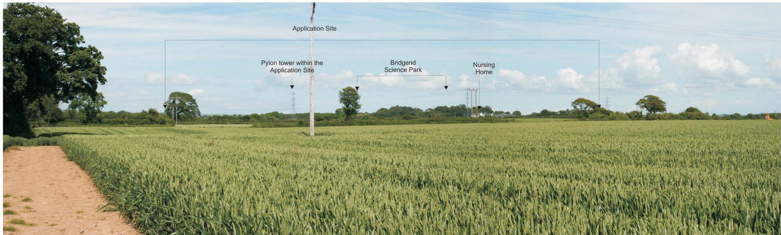
PRV 15 - View from footpath FP13MM northeast towards the Application Site