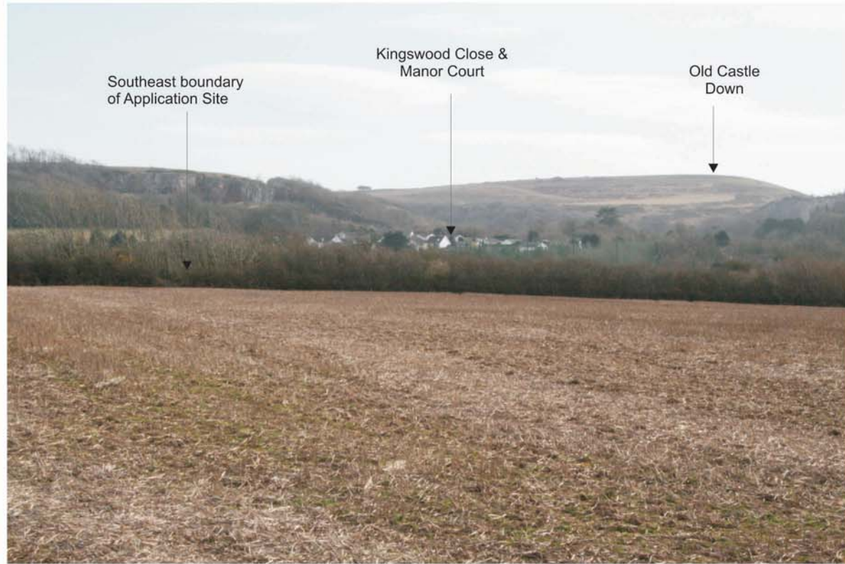
PRV 05 - View from within the site looking south towards the east boundary