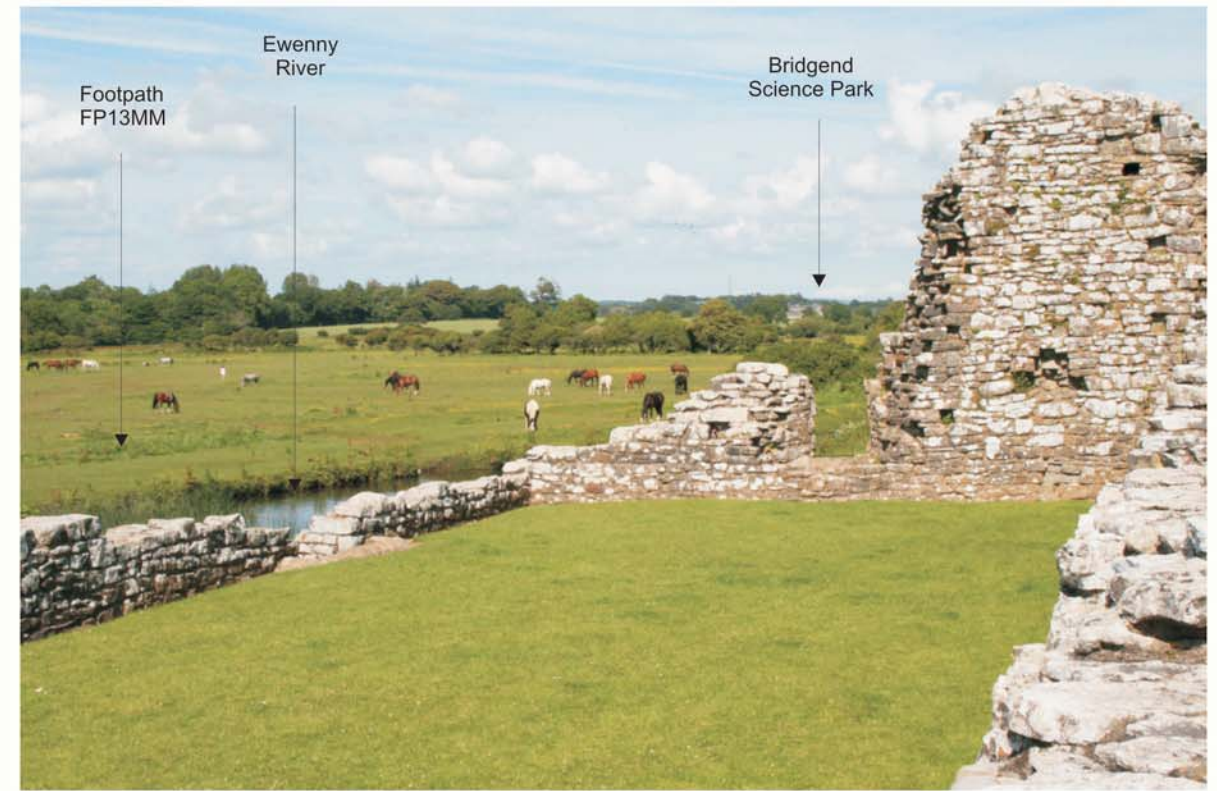
PRV 06 - View from the northern ramparts of Ogmore Castle looking northeast