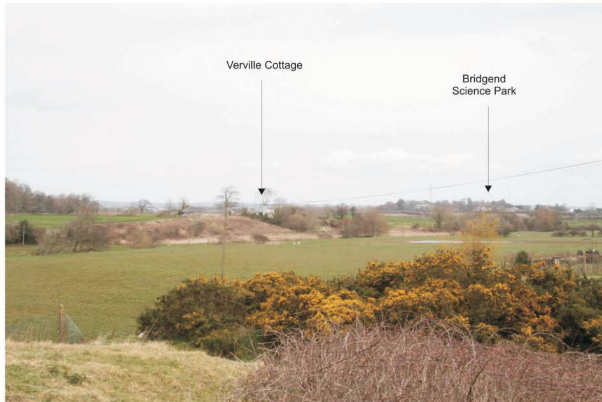
PRV 09 - View from Ogmores Road looking northeast