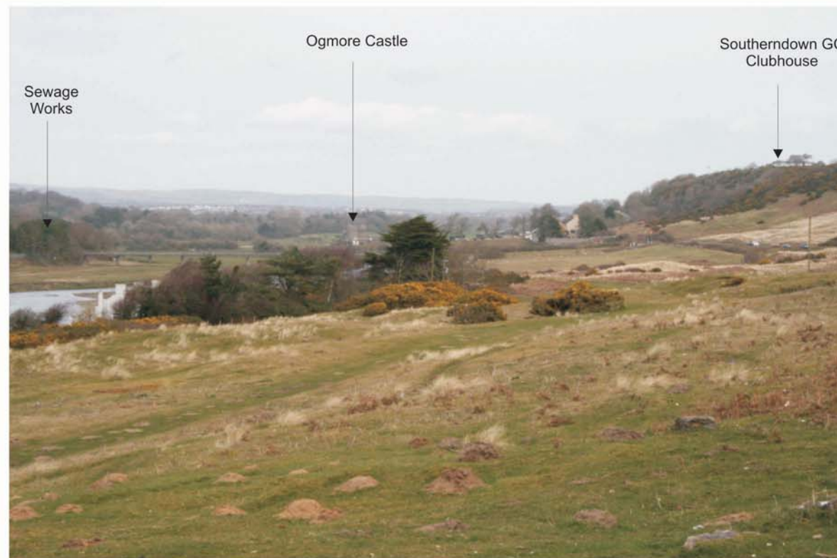
PRV 11 - View from Ogmores Road layby looking northeast