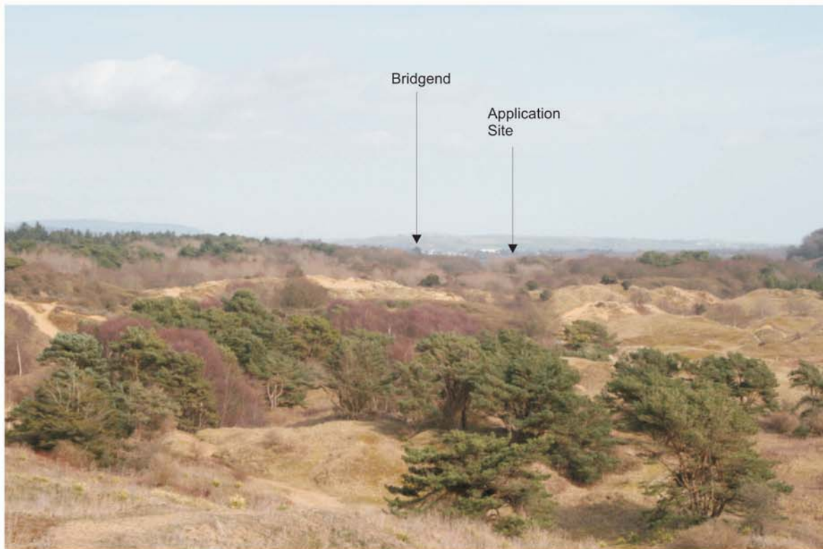
PRV 29 - View from Merthyr Mawr Warren. The site is just glimpsed above foreground vegetation