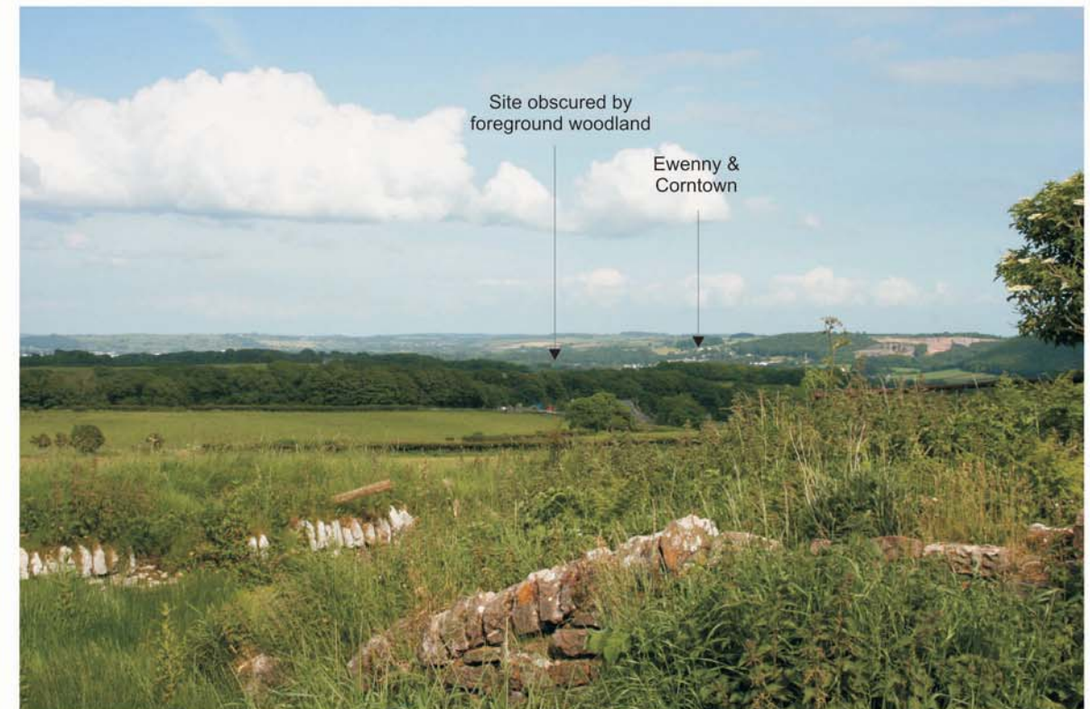
PRV 30 - View from footpath FP4MM north of Merthyr Mawr Warren looking east