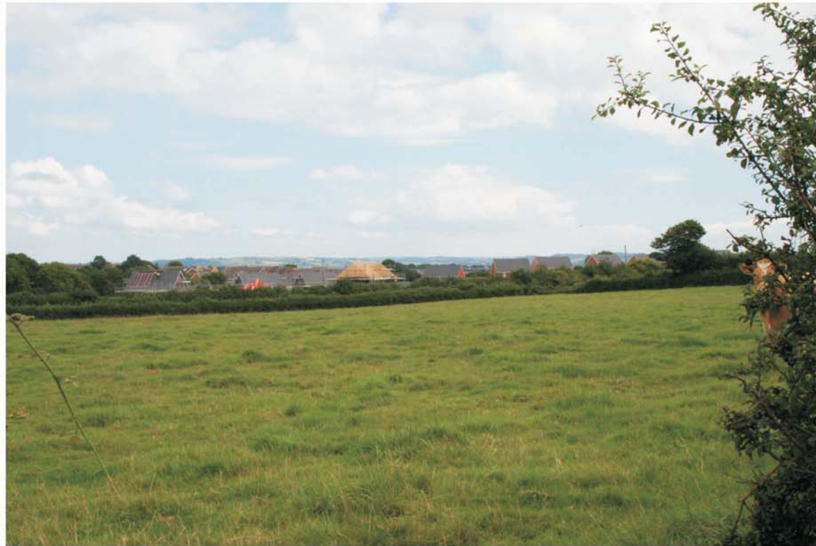
PRV 27 - View from footpath FP3LAL looking towards the new housing development at Broadlands